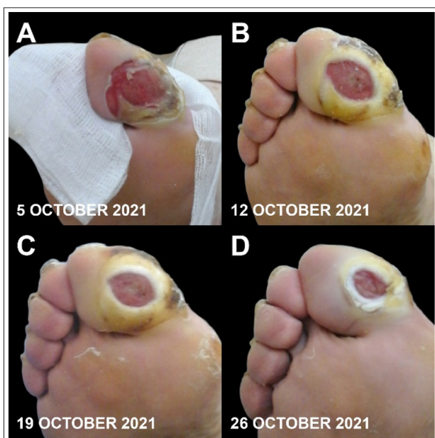
Figure 2: The lesions on this patient showed superficial ulceration and hyperkeratosis, an abnormal thickening of the outermost layer of the skin (2A). Assessment after 4 weeks showed a budding wound, suggesting effective wound healing. Indeed, a budding wound is the sign of optimal recovery of vascularization (2D).