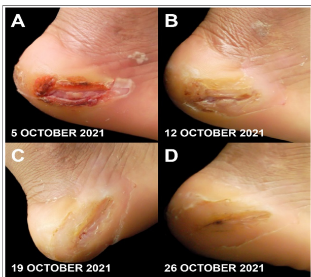
Figure 1: This patient had superficial ulceration limited by hyperkeratosis (1A). After 4 weeks, the patient achieved complete healing with residual hyperkeratosis with thick plantar skin (1D).

We became interested in exploring the use of topical CO 2 for diabetic ulcers following the recent availability of a novel, topical carboxytherapy gel (CO 2 Lift® Carboxy Gel. Lumisque, Inc.; Weston, FL USA). The product is provided as two components which, when combined, generates CO 2 gas for 45 minutes. The gel is applied to the lesion, left in place for 45 minutes, and then removed with the applicator spatula. In contrast to other forms of topical carboxytherapy, this commercially available product is well-suited for home use.