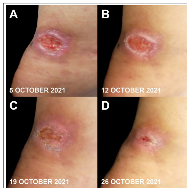
Figure 3: Panel 3A shows superficial ulceration next to the Achilles tendon with complete healing of the lesion (3D) after 4 weeks.

Laboratory studies included BUN and creatinine, hemoglobin A1C, osteomyelitis screening (CRP>10 and ESR>40), hematology assessment, deep wound bacteriology study and antibiogram, lower limb ecdoppler vascular multifrequency linear probe, and radiographs of the foot. Treatment included wound cleaning and debridement as needed, antibiotics, and blood sugar management. Patients were provided with a home supply of the CO 2 gel product (CO 2 LIFT®) and detailed written instructions for its use. The CO 2 gel was applied to foot ulcers at home three times weekly for 4 weeks.