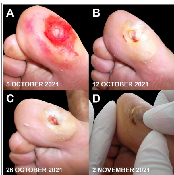
Figure 5: The initial superficial ulcer is shown in 5A. Complete healing with residual hyperkeratosis after 4 weeks is evident (5D).