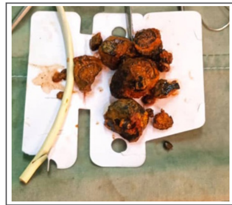
Figure 4: Biliary prosthesis and multiple extracted stones