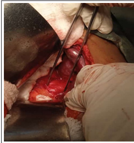
Figure 1: Common bile duct dilation

lithiasis of the primary distal common bile duct to which a wide sphincterotomy is performed with endoprosthesis placement. of 18 frech with previous extraction maneuvers of the same one not being effective for what is suggested traditional surgical treatment of the strahepatic bile duct for the performance of choledolithotomy. Once re-evaluated by our service and by the anesthesiology service, the patient's surgery is scheduled on 02/15/2023, confirming the referred preoperative diagnosis where opening, extraction, washing, and permeabilization of the GBV are made. The endoprosthesis was removed and a T-tube was placed by misadventure. On the seventh day, percutaneous cholangiography was performed through the T-tube.