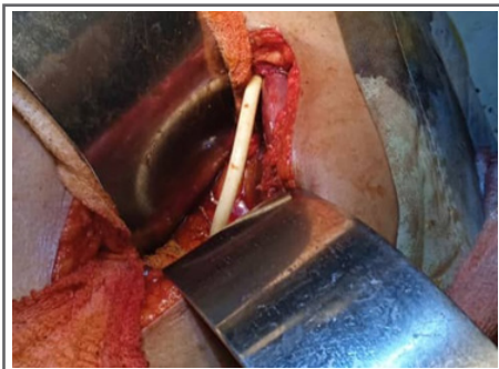
Figure 3: Extraction of the bioprosthesis