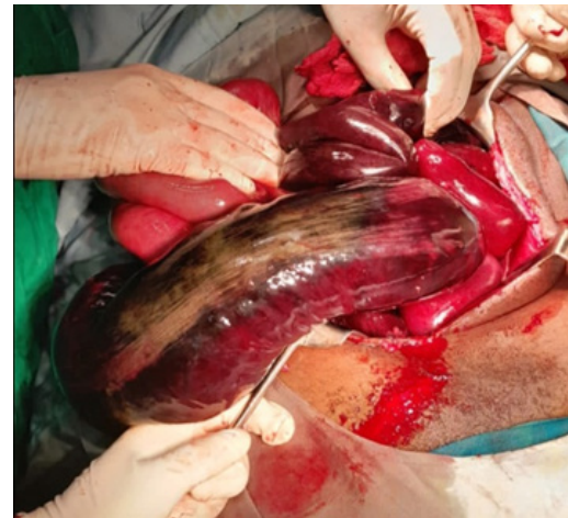
Figure 2: Initial image during laparotomy