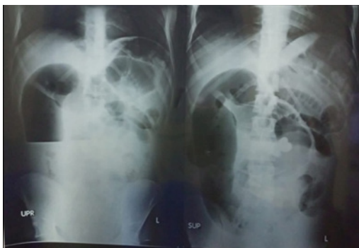
Figure 1: Shows preoperative radiological study