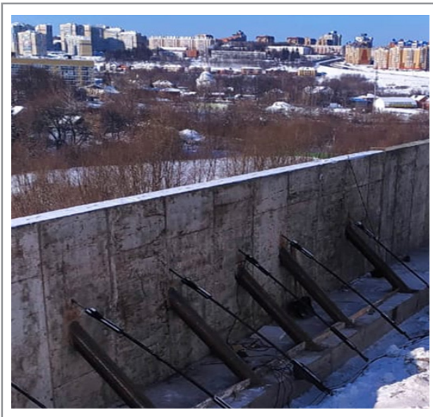
Figure 3: Recessed retaining reinforced concrete structures using ERT bored piles (RIT, FORST, ERST), ERT ground anchors and monolithic reinforced concrete corner retaining walls in the city. Cheboksary